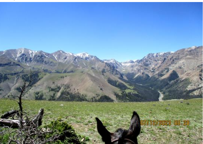
Above: Timber Creek July 10 & 12